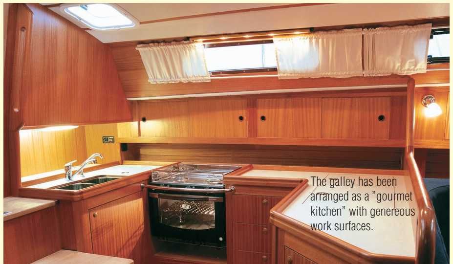
The galley has been arranged as a "gourmet kitchen" with generous work surfaces.