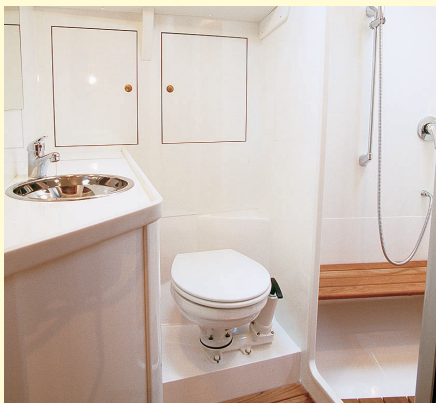
The large toilet compartment ( over 90 cm width ) is located next to the owners cabin and is easily accessible from both the saloon and from owners cabin. Shower area is separated from the toilet.