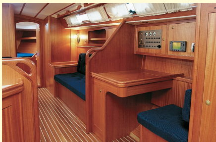
Navigation compartment is located on starboard. Chart table and generous space for individual instrumentation layout.